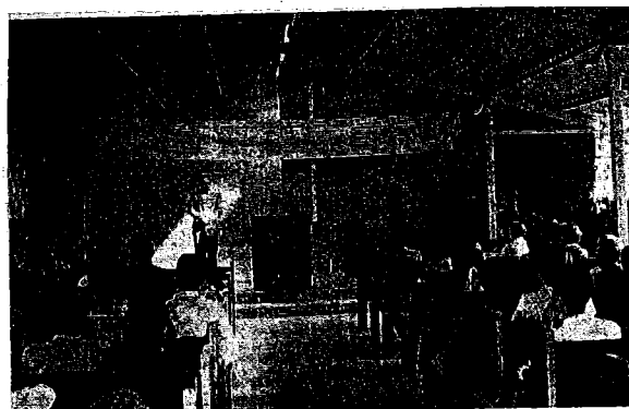
The classes were well attended.

July 29 - August 1 were days of spiritual blessings for those who took time to attend the second church retreat of our Mennonite churches in Cachipay. Increased interest and growth in the work were manifested by the attendance which was considerably higher than last year.